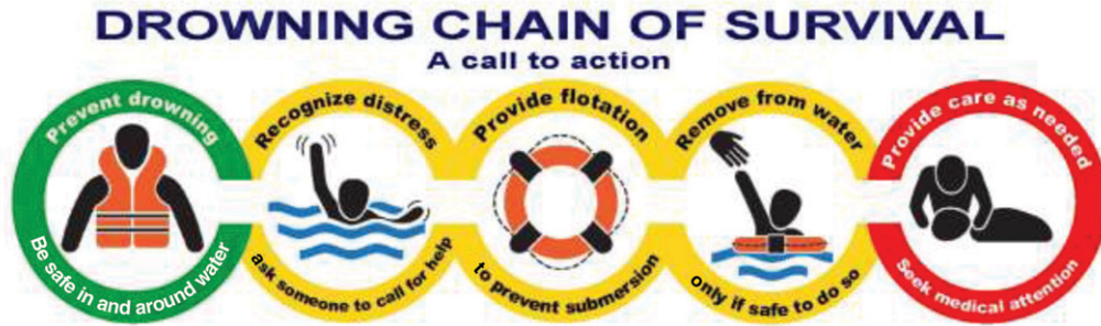
FIGURE 1 Drowning chain of survival. Adapted from Szpilman D, Webber J, Quan L, et al. Creating a drowning chain of survival. Resuscitation . 2014;85(9):1151.

underscores the critically time-sensitive role of the parent or supervising adult in preventing a drowning and stopping it from becoming a fatality.